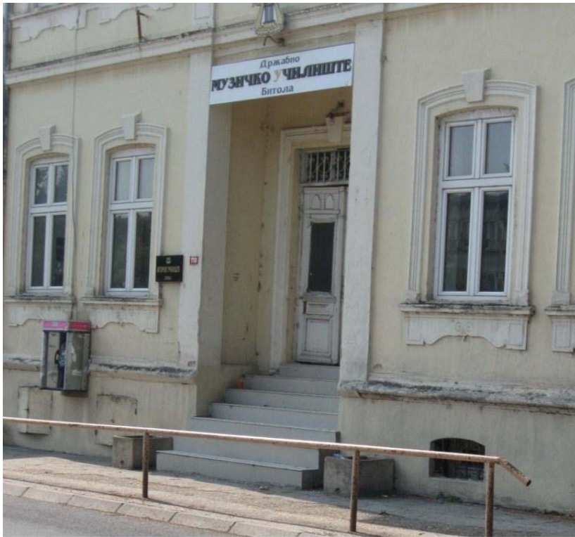
Music school - Bitola