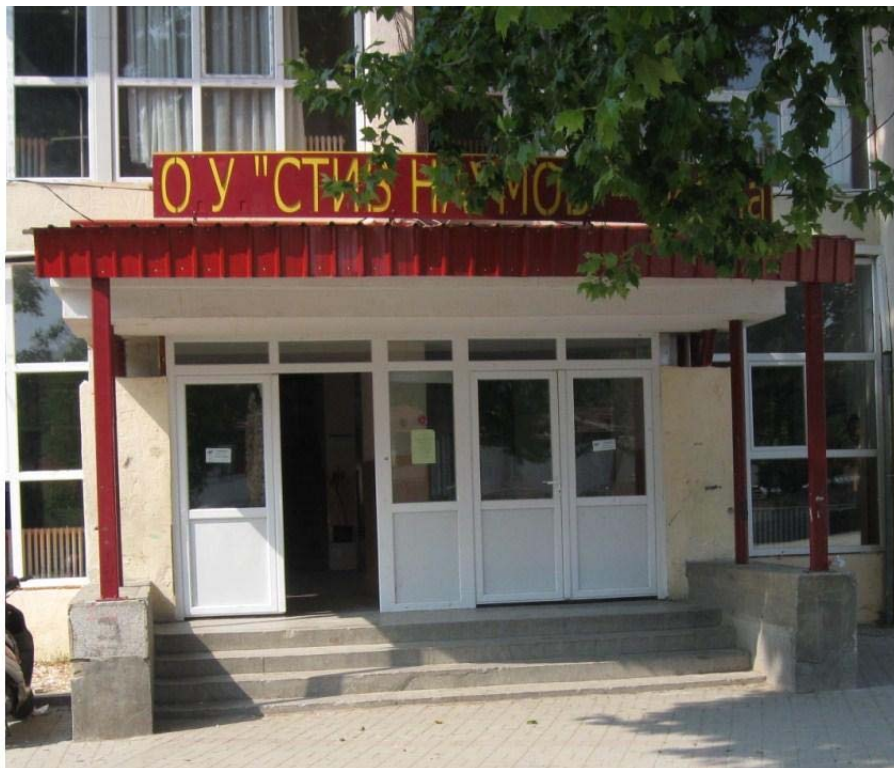
Primary school "Stiv Naumov" - Bitola