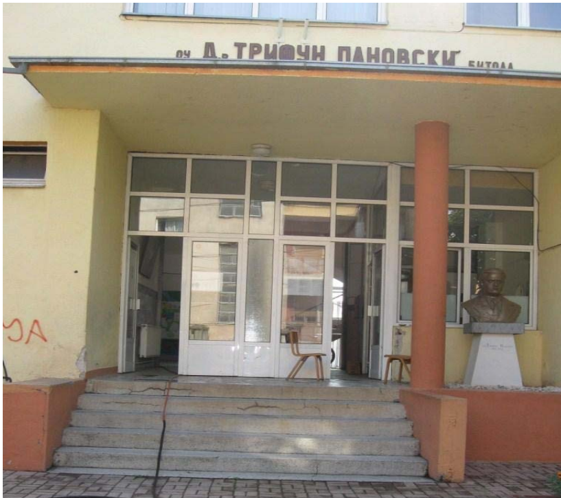
Primary school "Dr Trifun Panovski – Bitola