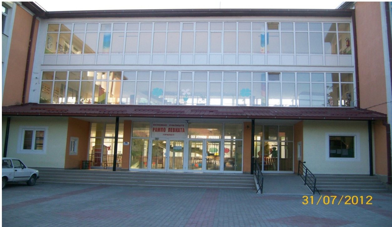
Primary School "Rampo Levkata" – Prilep