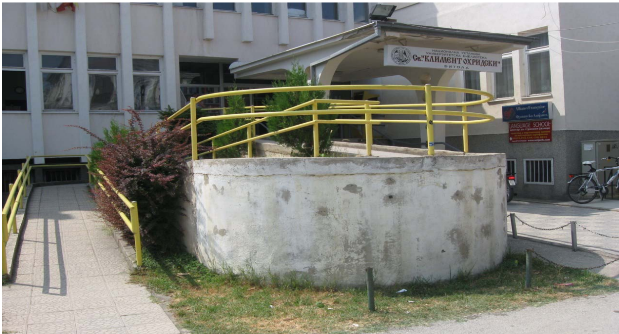
Approach to City Library "Ss. Kliment Ohridski" - Bitola