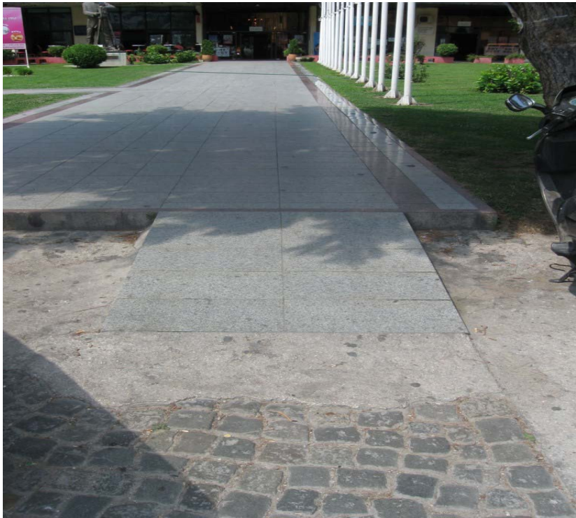
Approach to the Cultural Center - Bitola