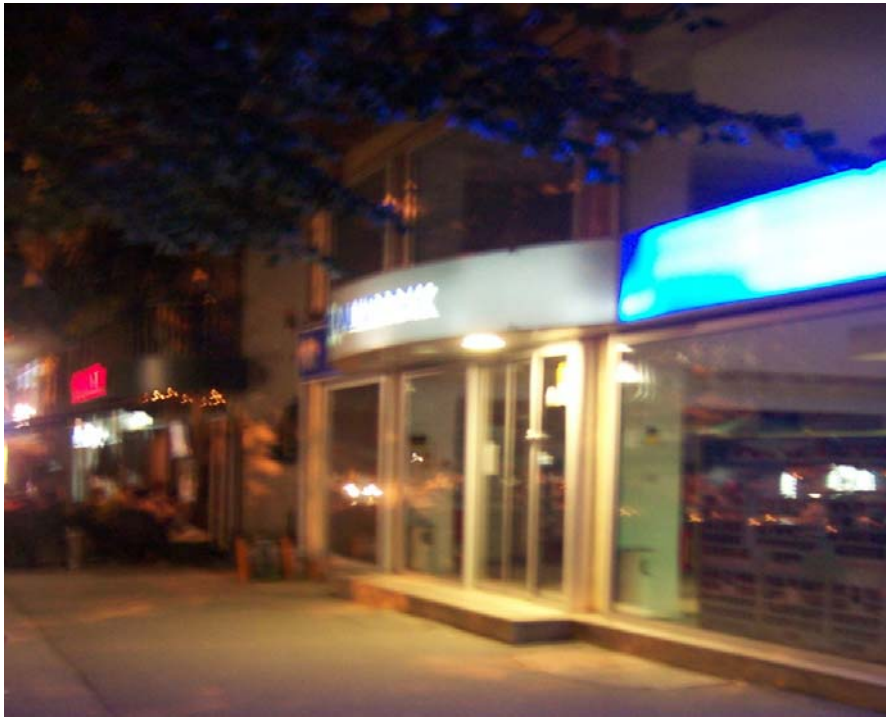
Halk bank – Prilep