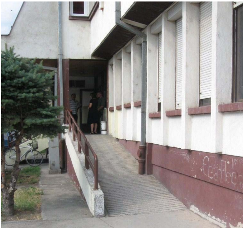
Center for Social care- Bitola