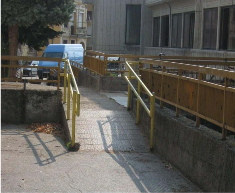
Access to the theater and primary school Goce Delchev (a common access because it share a common yard - rear entry)