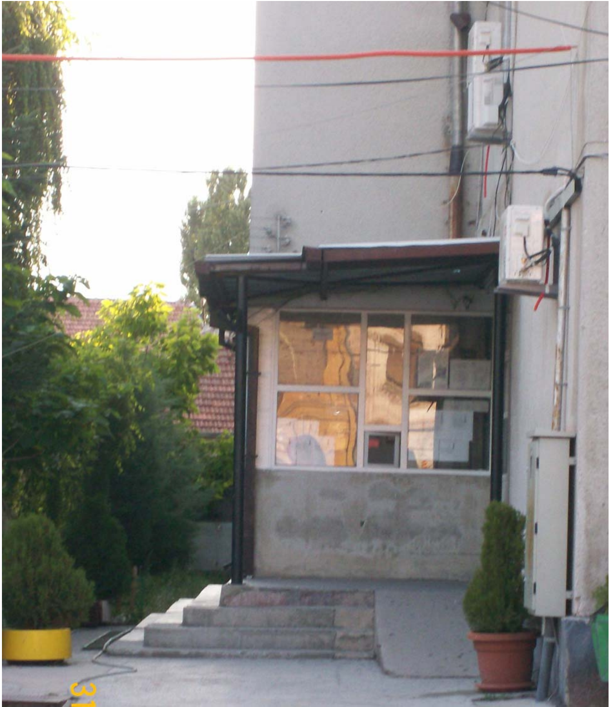
Secondary School "Kuzman Josifoski – Pitu" - Prilep