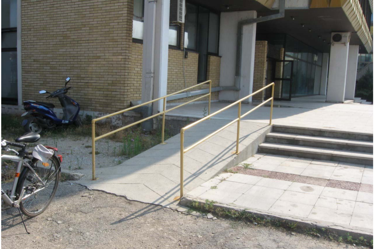
Approach to PC Strezevo – Bitola