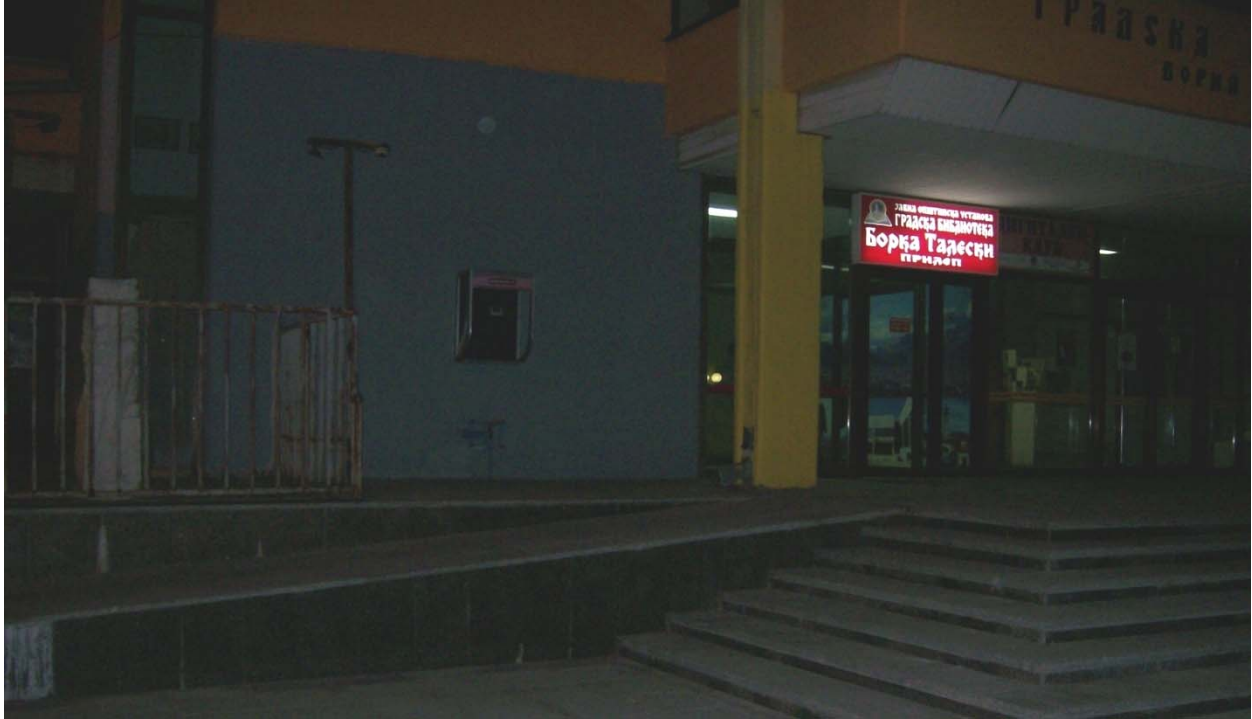
City library "Borka Taleski" - Prilep