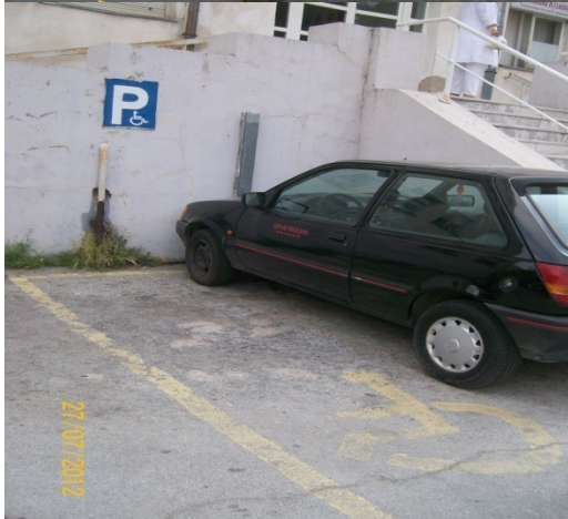
Health Centre - Prilep