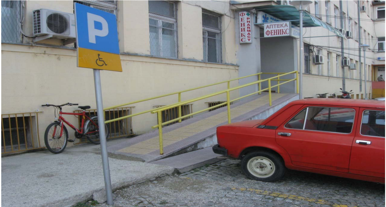
Home for National Health (rear entrance) and parking for persons with disabilities – Bitola