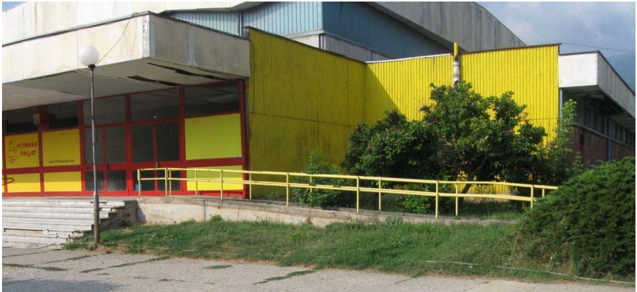
Sports Hall - Bitola