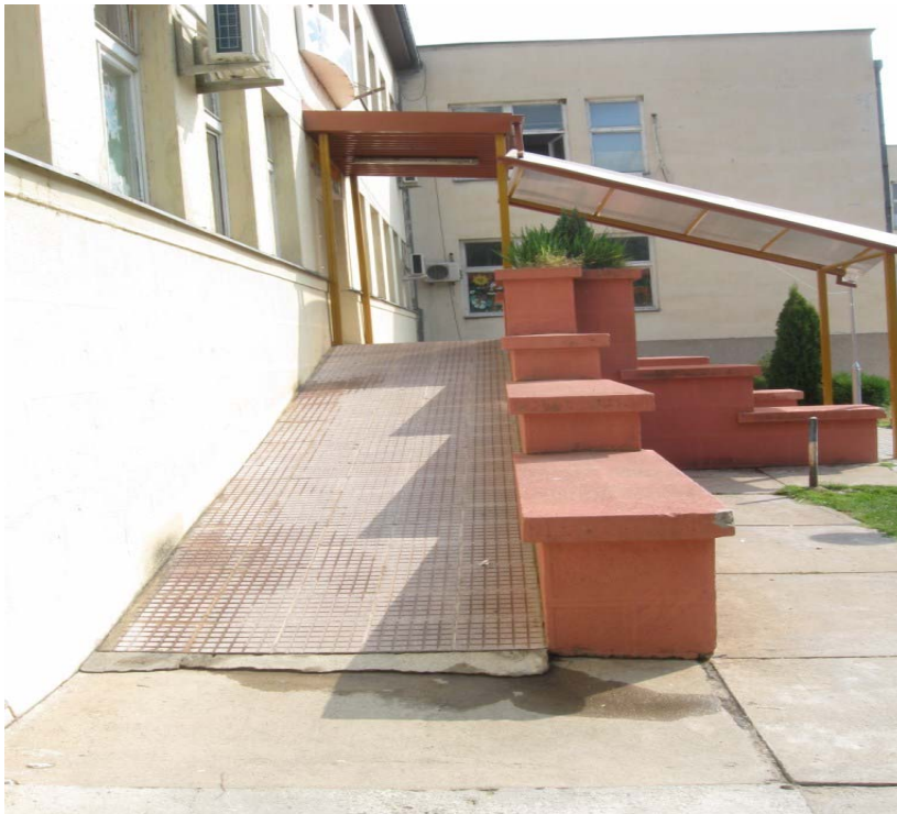
Home for National Health (Dispensary for children) -Bitola