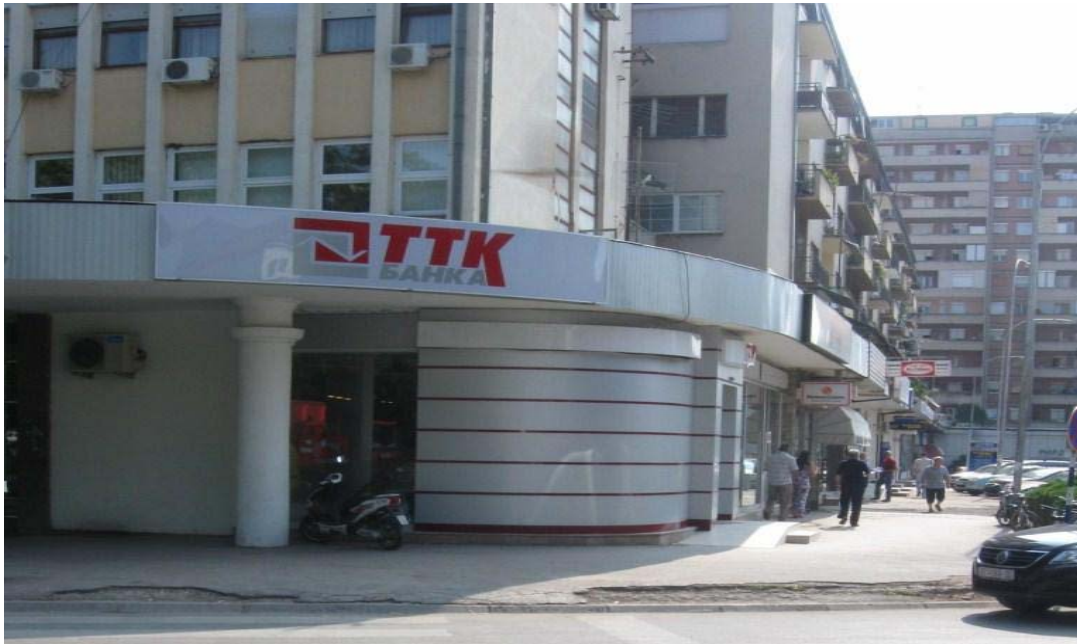
TTK bank - Bitola