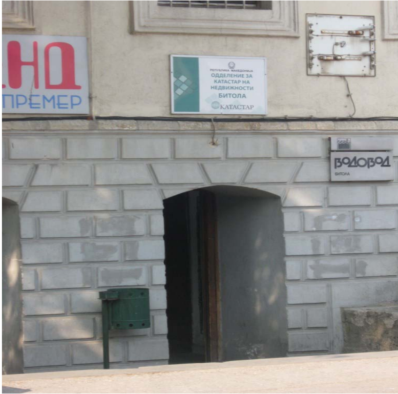
Landregistry and waterworks (are located in the same building that doesn't have approach for persons with disabilities) – Bitola