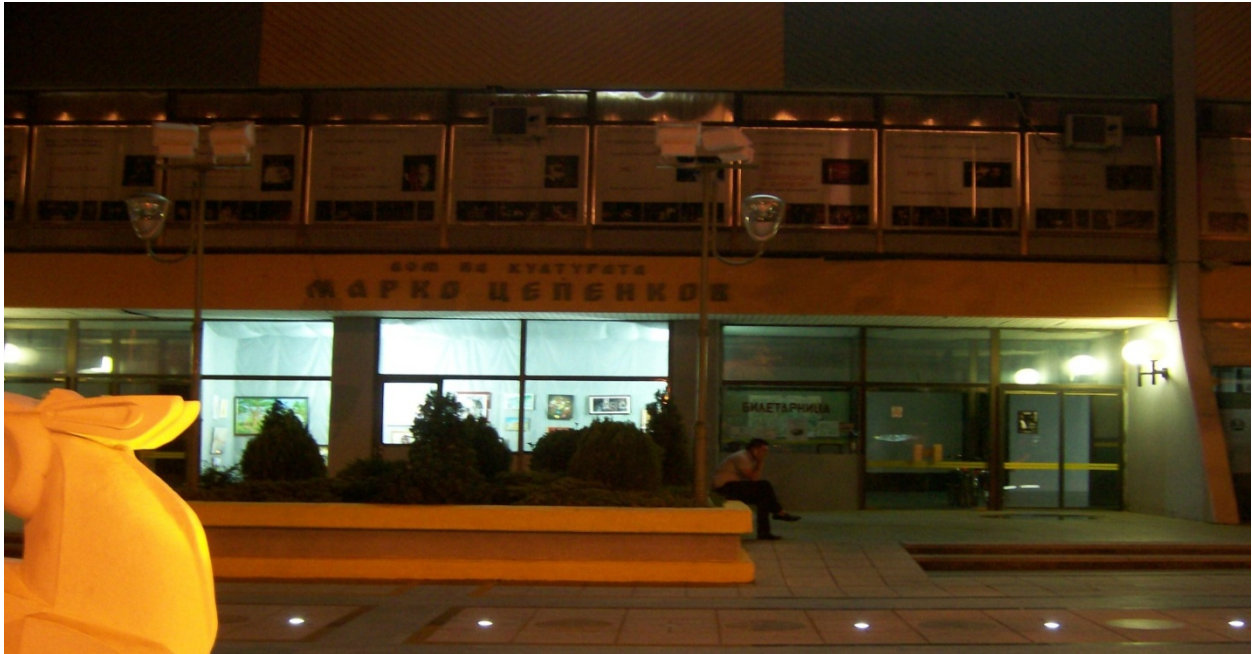
Access to the Cultural Center "Marko Cepenkov" - Prilep