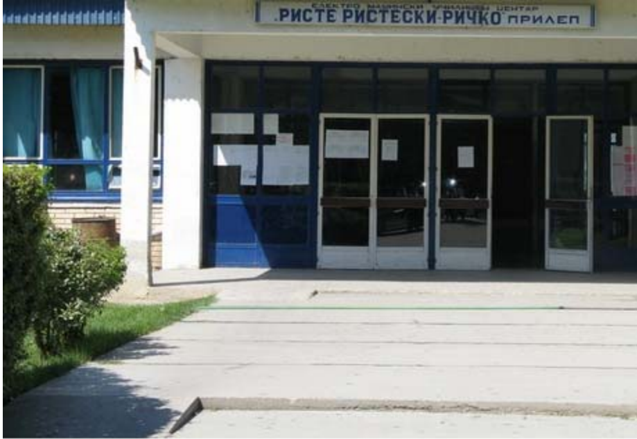
Secondary School "Riste Risteski – Ricko" - Prilep