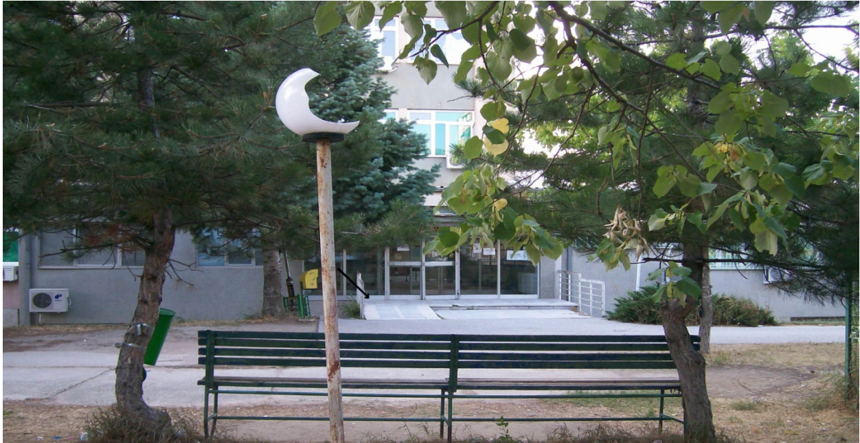
Back entrance of the general hospital "Borka Talesmki" - Prilep