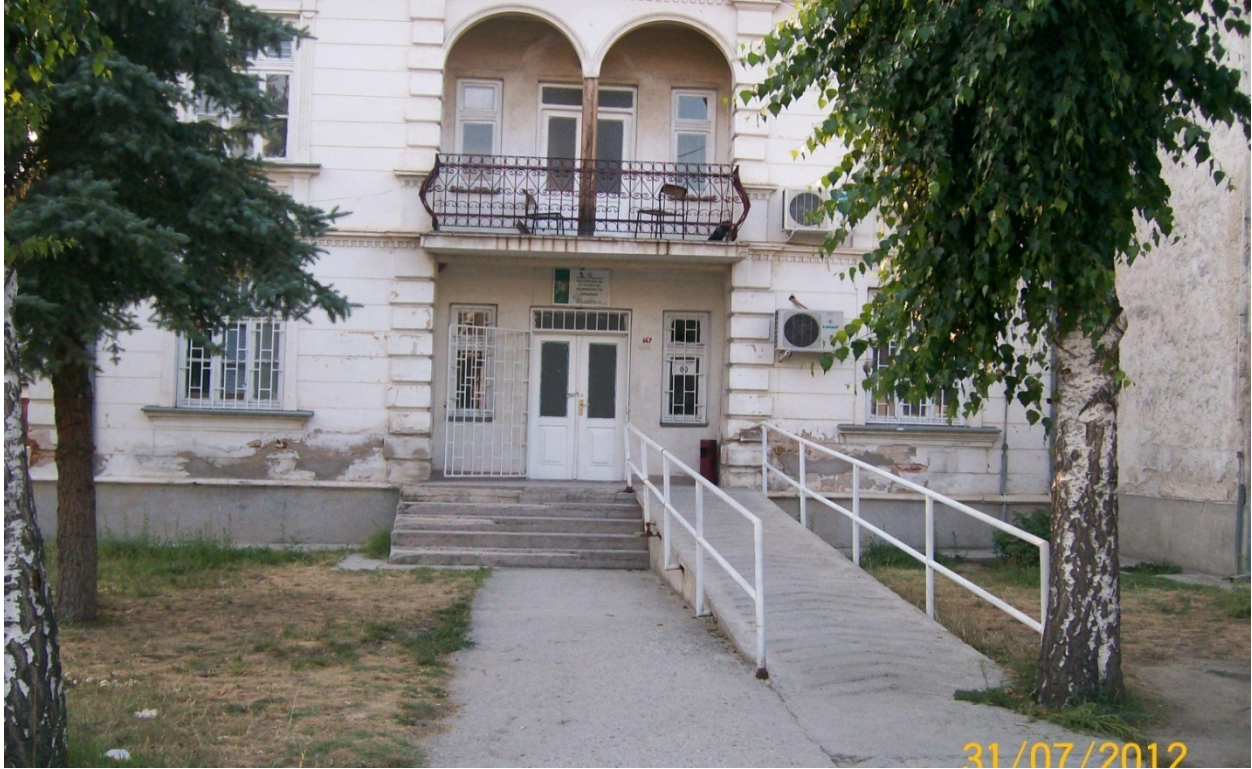
Landregistry - Prilep