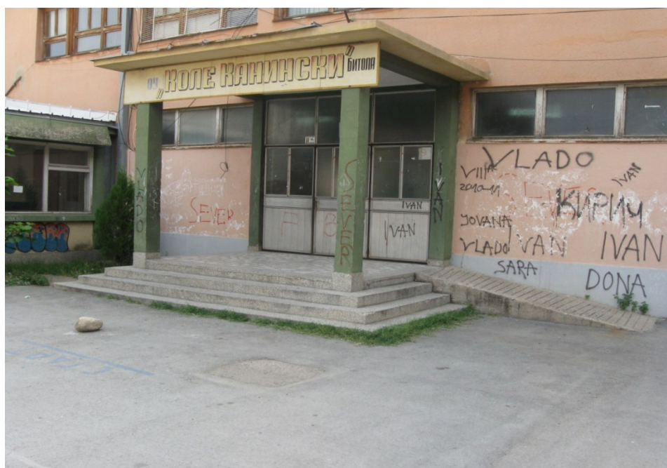
Primary School "Kole Kaninski" – Bitola