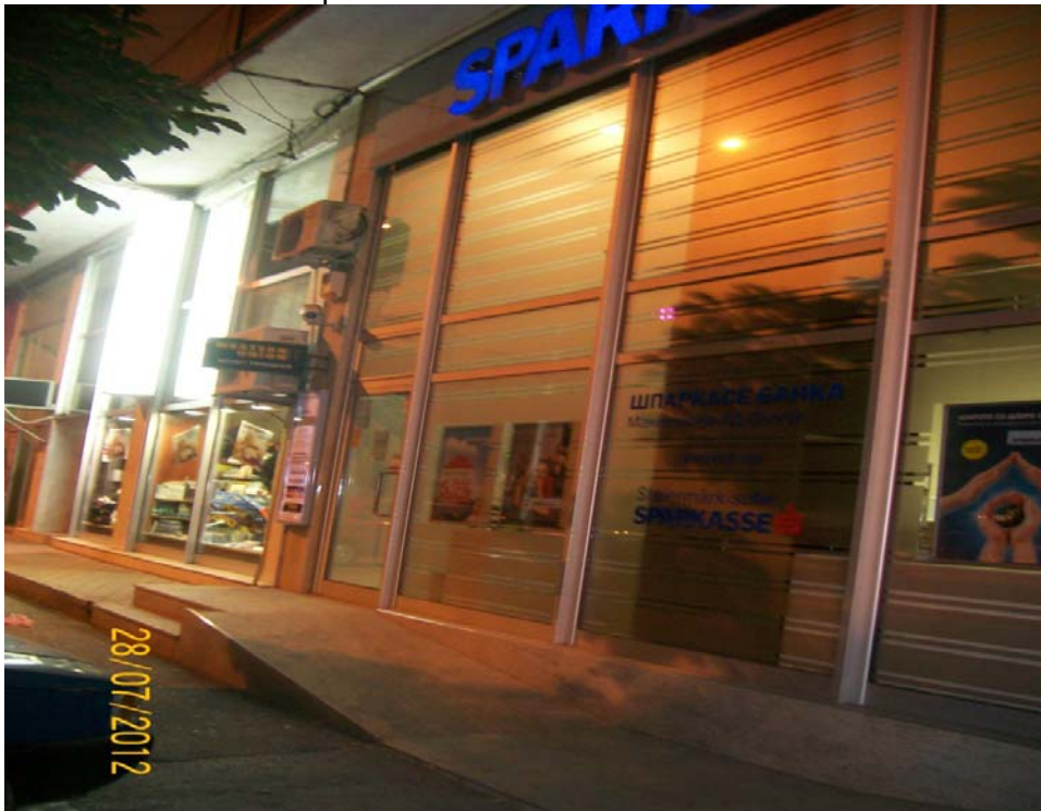
Sparcasse bank - Prilep