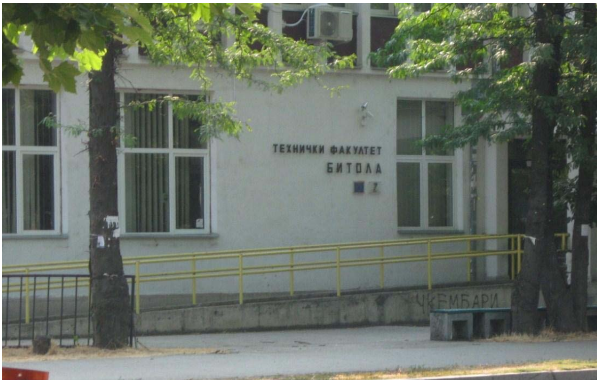
Technical Faculty - Bitola