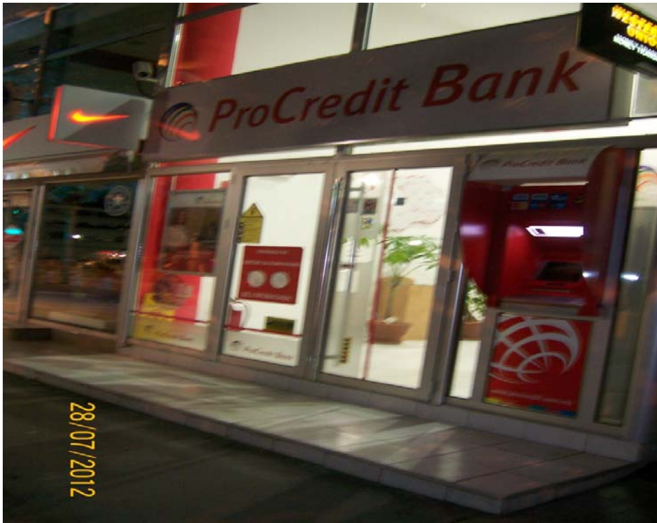
Pro Credit Bank - Prilep