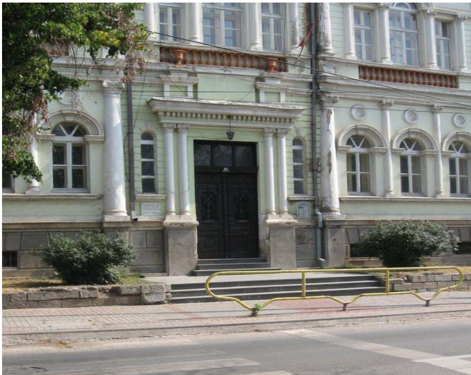
Secondary school "Josip Broz Tito" - Bitola