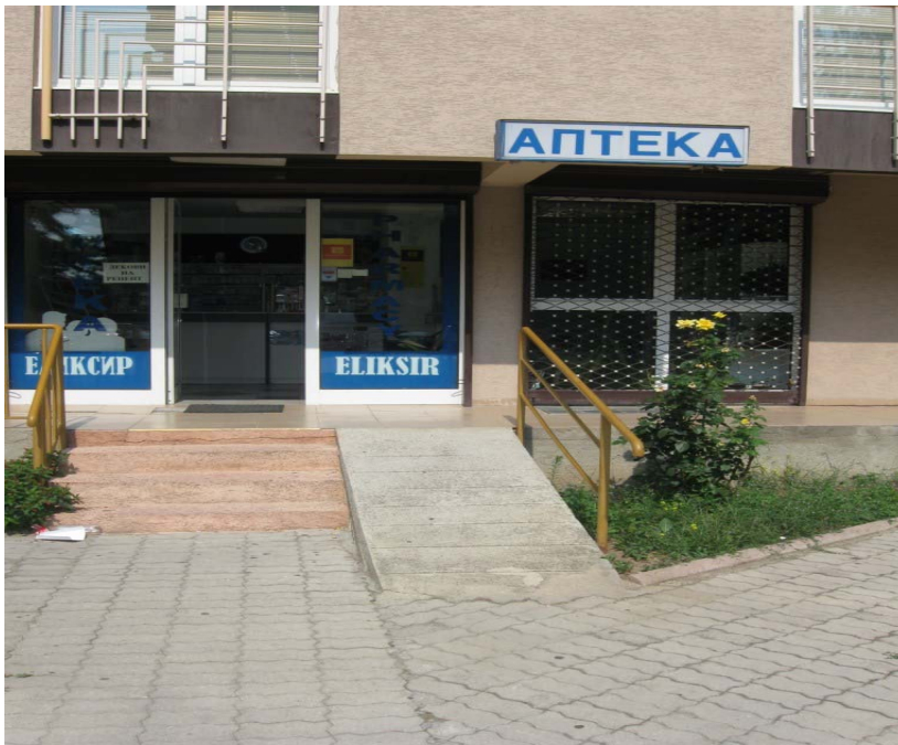
Pharmacy Elixir - Bitola