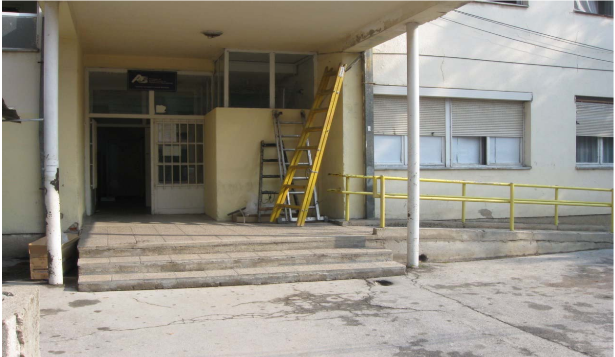
Employment Agency – Bitola