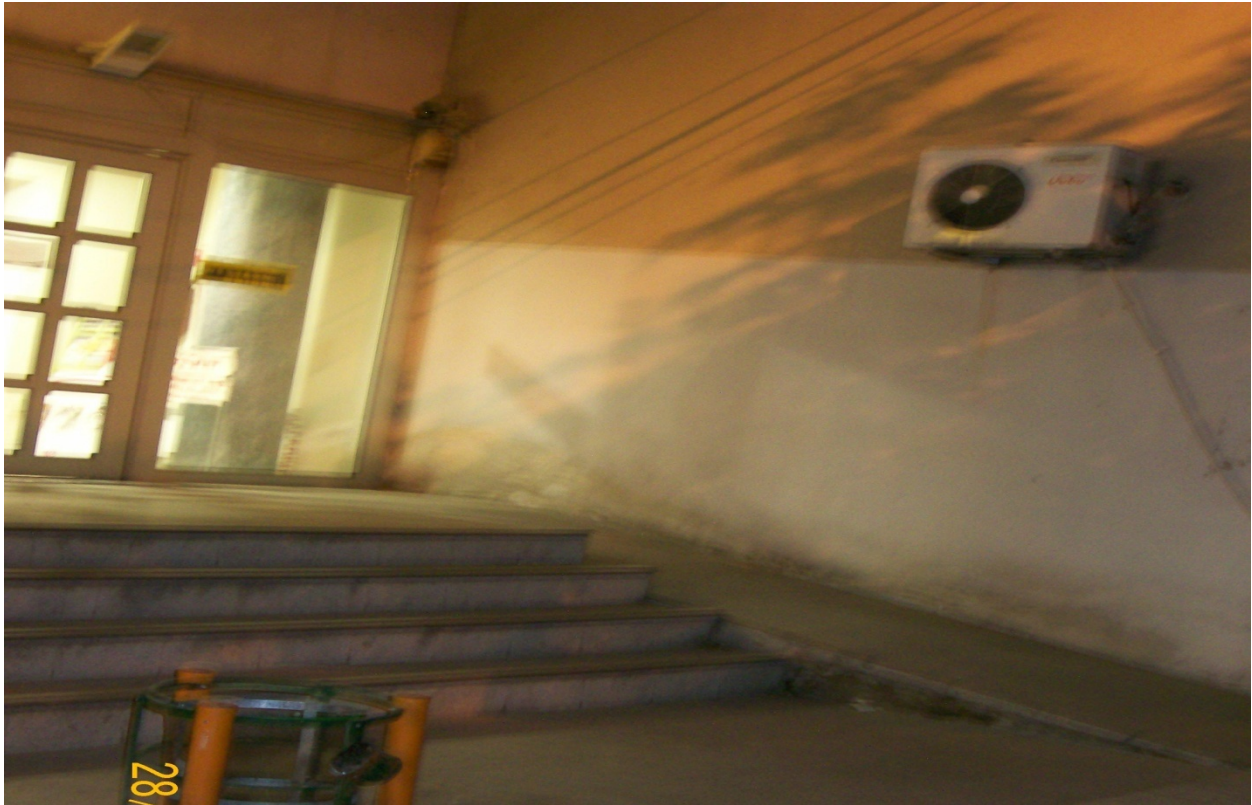
Stopanska Bank - Prilep