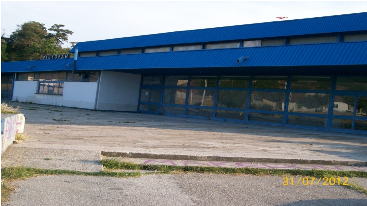
Sports Hall - Prilep