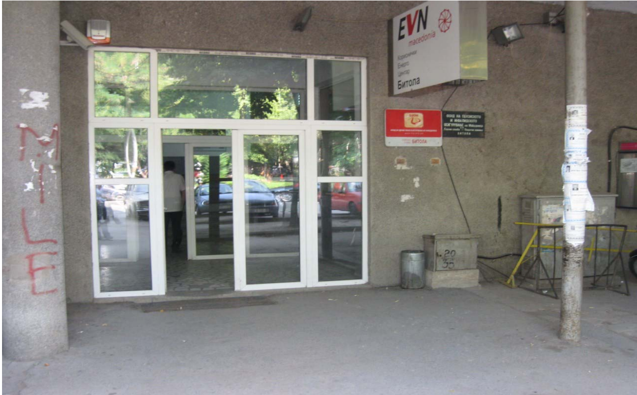
Pension, disability and health insurance (the entrance of the building is on ground floor) – Bitola