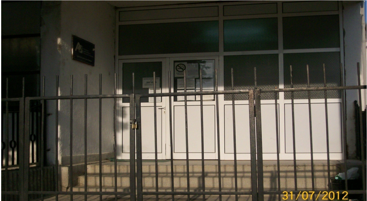
Employment Agency – Prilep