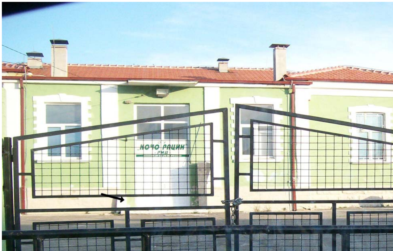
Primary School "Koco Racin" in settlement "Rid" - Prilep