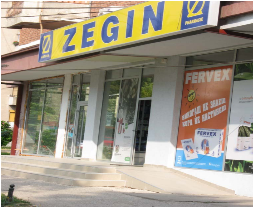
Pharmacy Zegin – Bitola