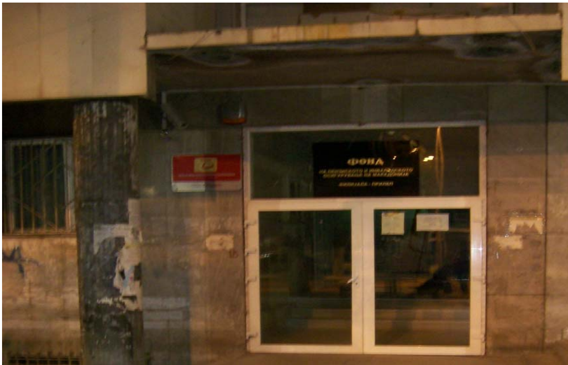
The Pension and Disability Fund, the Health Insurance Fund and Central Registry – Prilep. Share the same building with different entrance. The building is at ground level, immediately after the entrance there are steps but access for people with disabilities is not available.