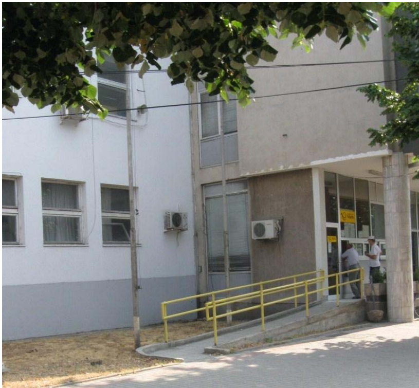
Municipal Court - Bitola