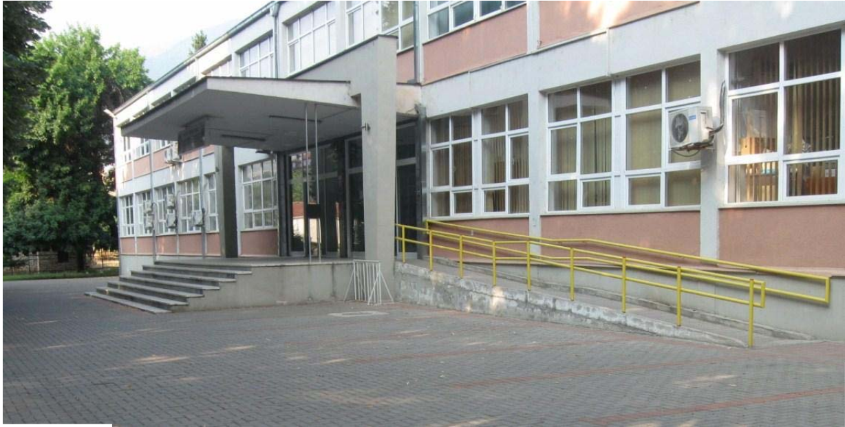
Pedagogical Faculty – Bitola