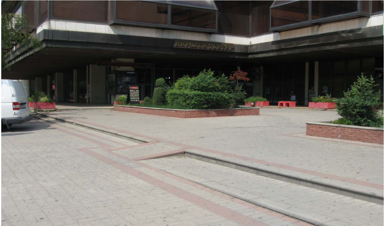
Approach to the National Theatre – Bitola