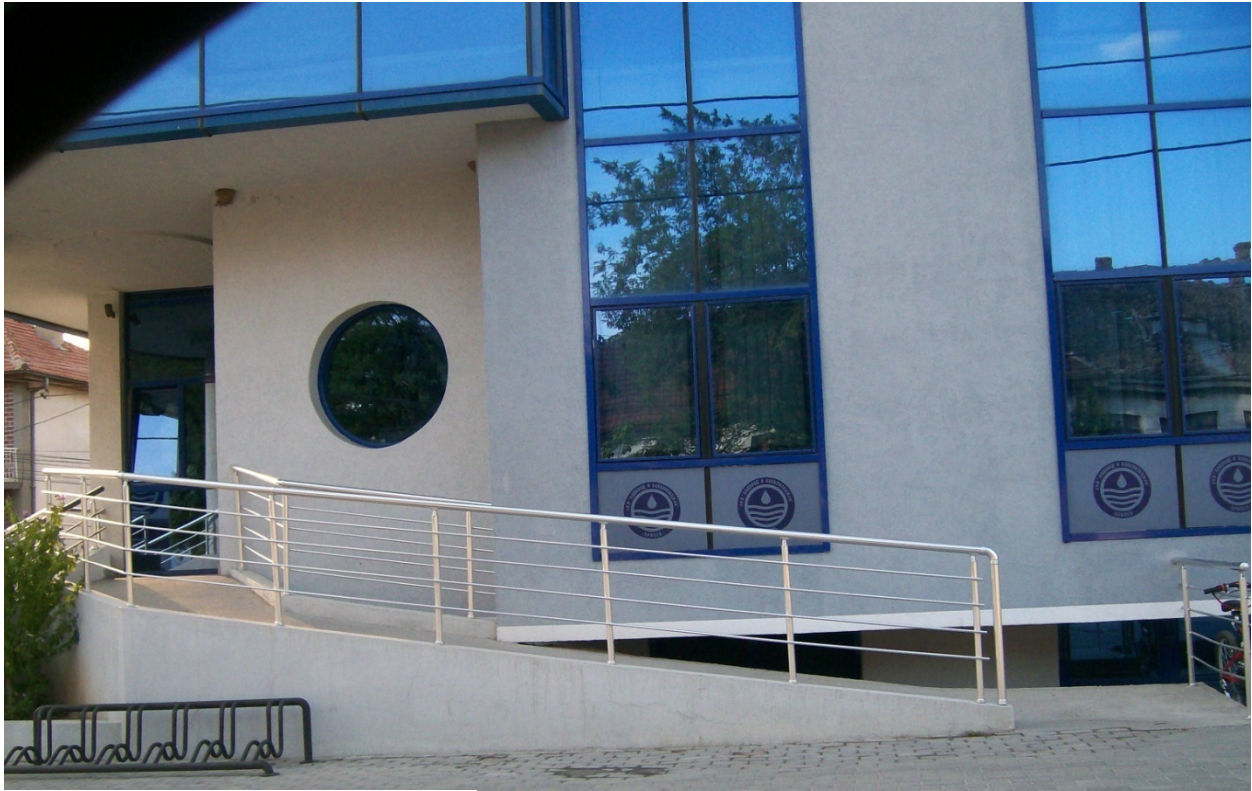
Waterworks and canalization - Prilep