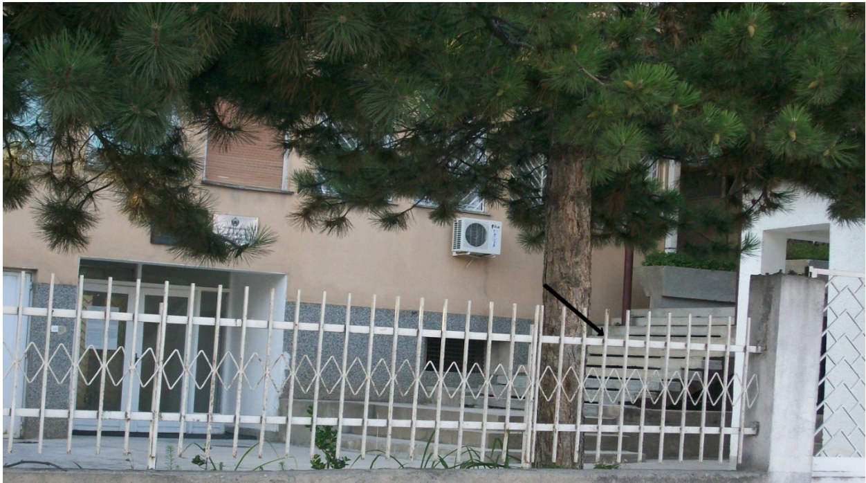
Ministry of Defence branch - Prilep