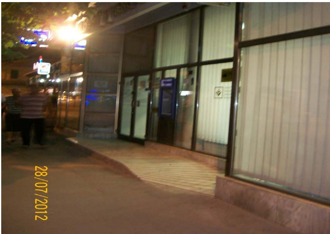
Tutunska bank - Prilep