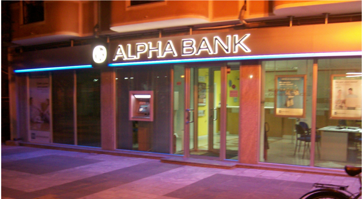
Alpha Bank - Prilep